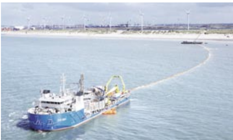
ABB anticipates that, based on previous HVDC and cable technology development rates, the residual technology gaps will be closed to make the European Supergrid a reality. ■

Establishing the ENTSO-E (a European TSO cooperative association) in 2008 was a major step towards the formation of rules and frameworks to support future grids.